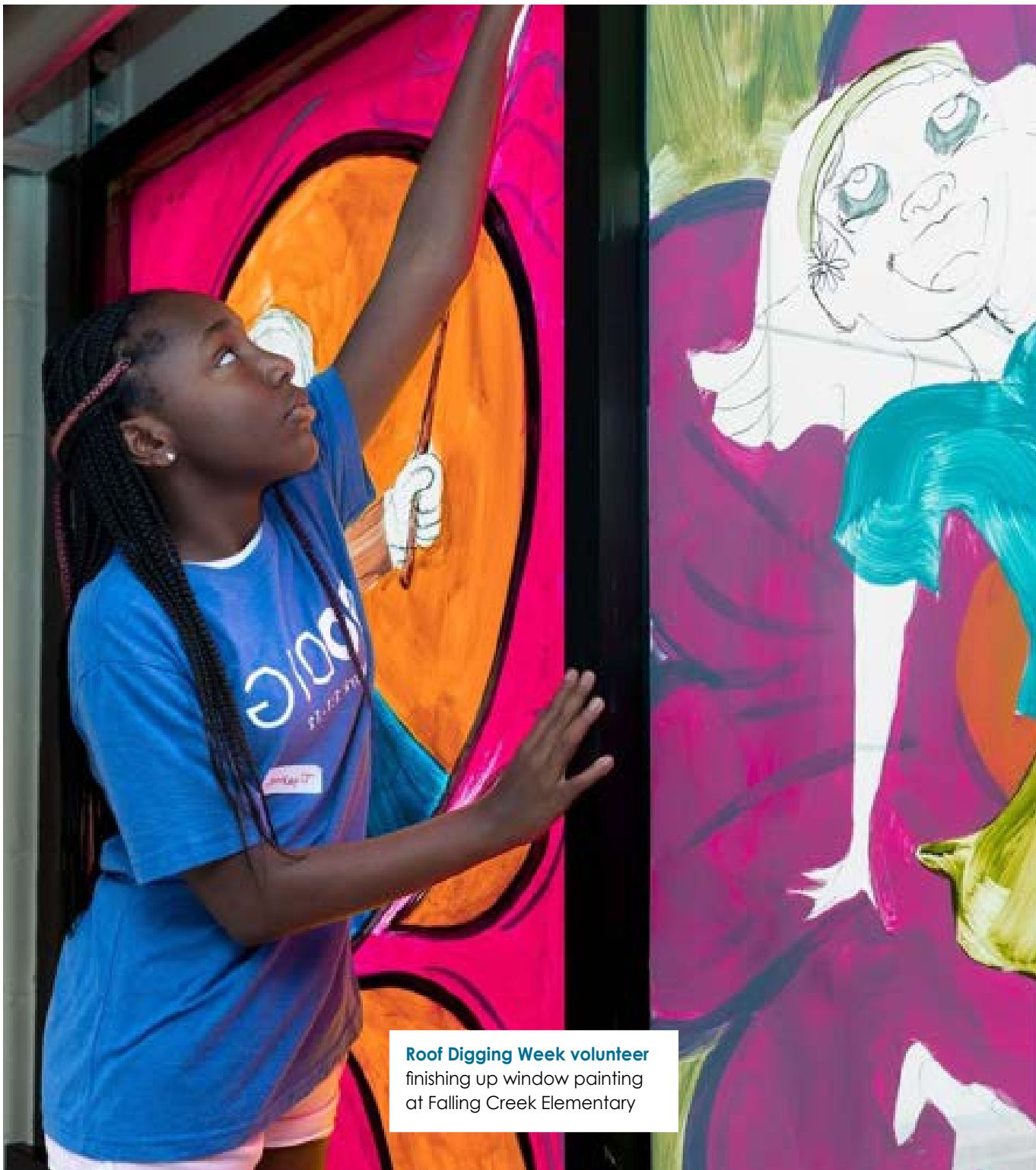
Roof Digging Week volunteer finishing up window painting at Falling Creek Elementary