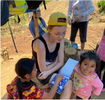
Guatemala Mission Team served vulnerable children in the Lake Atitlan region.

At Woodlake UMC, we prioritize serving vulnerable children and those facing food insecurity.