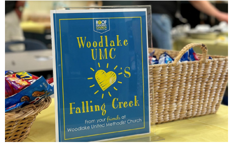
Support of local schools provides encouragement to teachers which spreads goodness to students.

Roof-diggers give hundreds of hours getting food into the hands of 525+ families at Belmont Food Pantry each week.